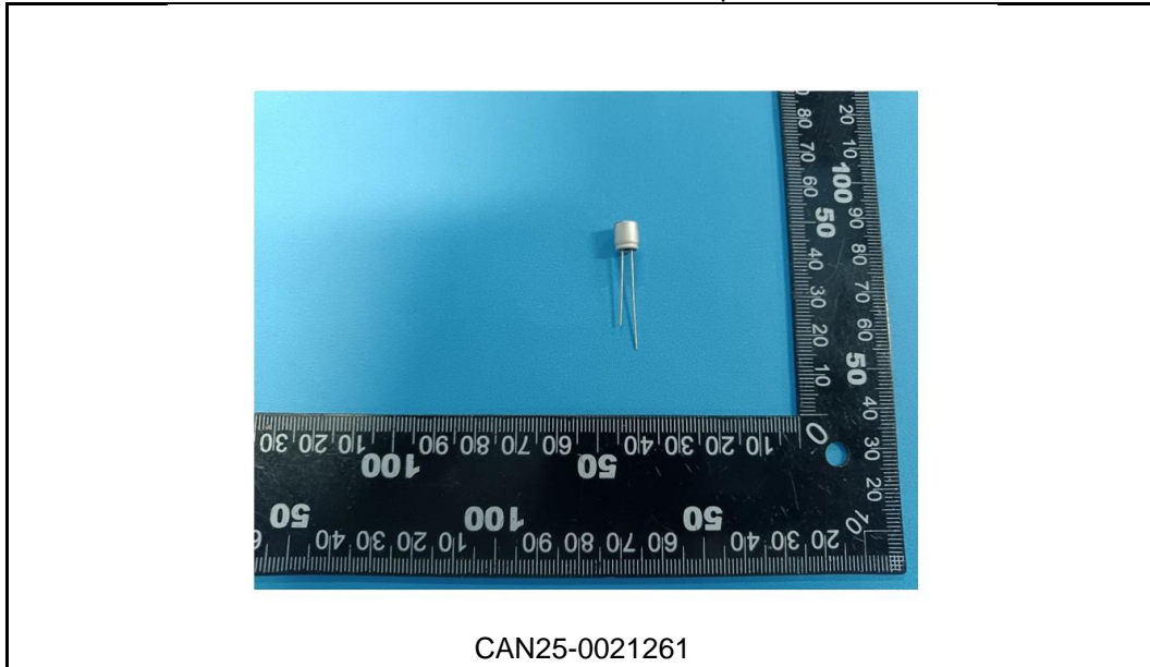
Photo of Submitted Sample

SGS authenticate the photo on original report only